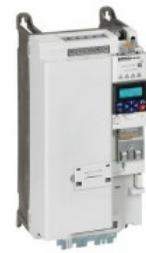
Variable speed drives VLB3